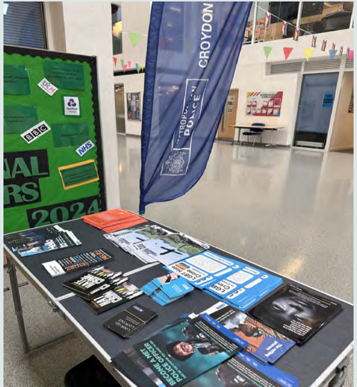
Crime prevention Stall at Coulsdon sixth form college.