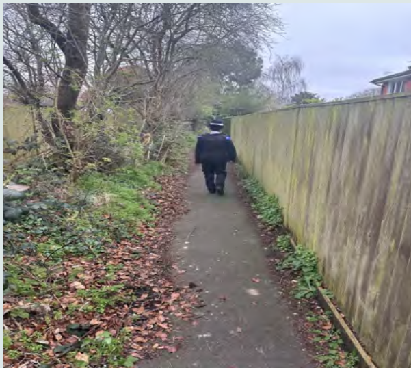
SNT on proactive patrol at Deans walk footpath