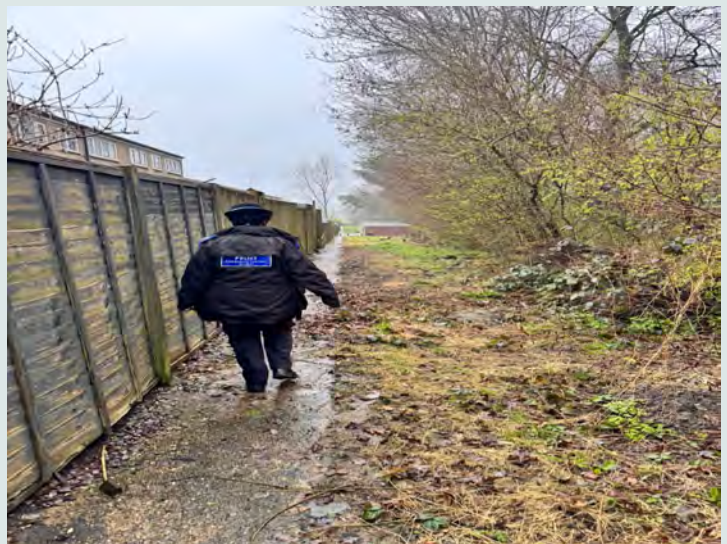
SNT on proactive patrol at Birchfield and Southlands