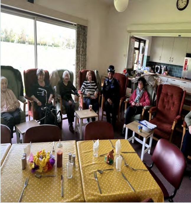
Safer Neighbourhood Team at the centre To give crime prevention advice on scams