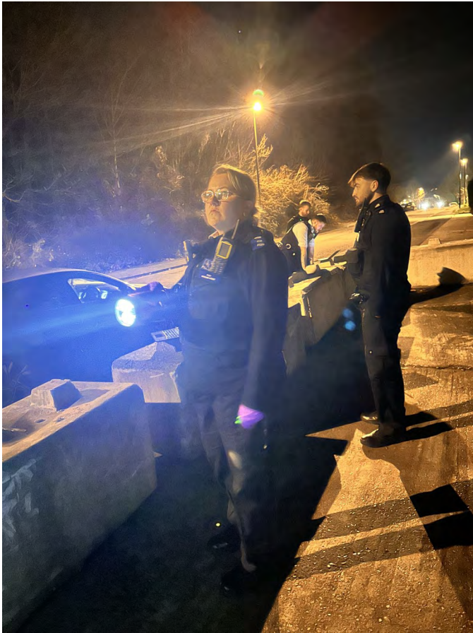
SNT on Burglary patrols